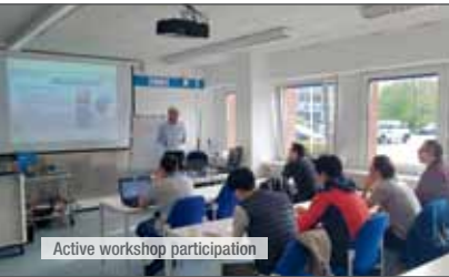
Active workshop participation