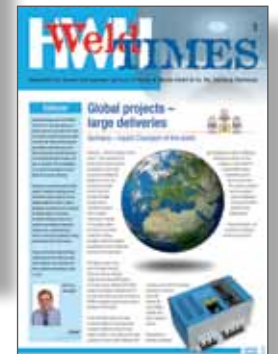
5 th issue September 2012