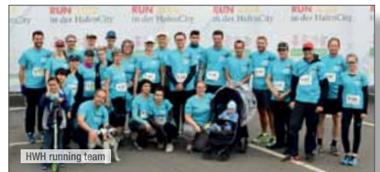
HWH running team

a dog is joining our team and has fun. Hence it's not so simple to calculate the number of runners in our team just by counting the legs and divide by two, we have also members on four legs. We are proud to be part of this run and to give to others who deserve it is also a moment to think about how good we all have it every