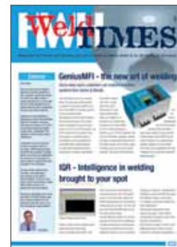
1 st issue September 2008

Our international sales and service network has been grown over the years giving you, our customers, the support you are asking for and deserve.